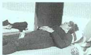
Will's dive plans for the same day on the back page.