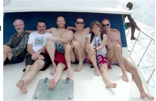
Relaxing on the bow of the Dive Fair Helen