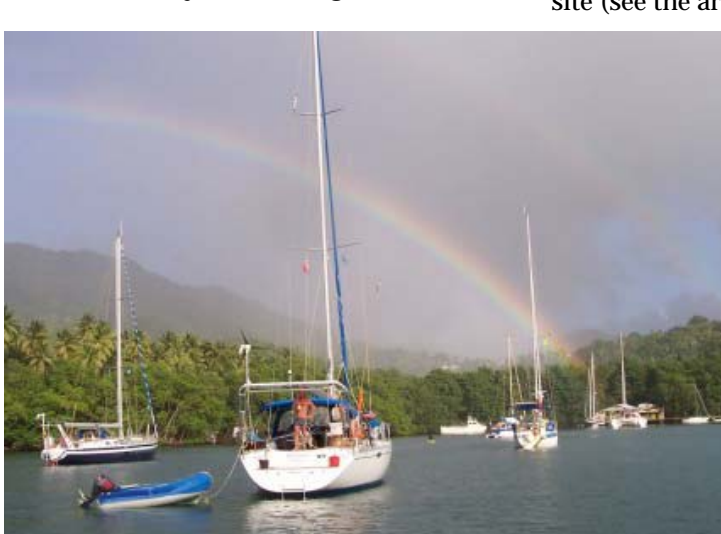
The harbor in St. Lucia.

In other news, this past month, we had the first of our joint meetings with the