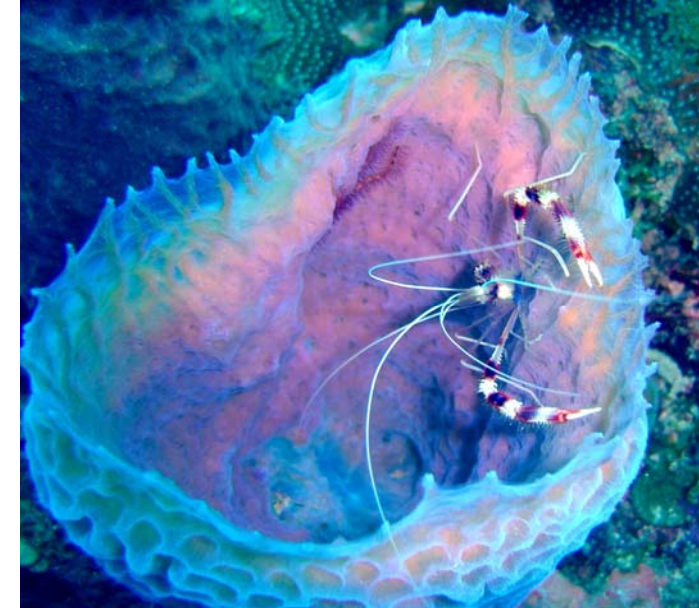
[Above] Coral-banded shrimp at a cleaning station, looking for customers. [Left] Stonefish where you least expect them \dots