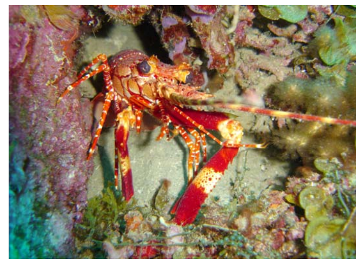
Lobsters aplenty! Several species are abundant

Names like Devil's Hole, Virgin Point, Bay of Pigs, Witch's Haven