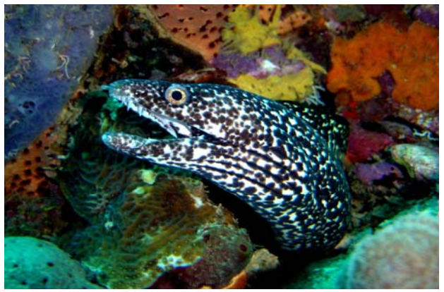
[Left] Spotted moray eel checking me out... am I edible?