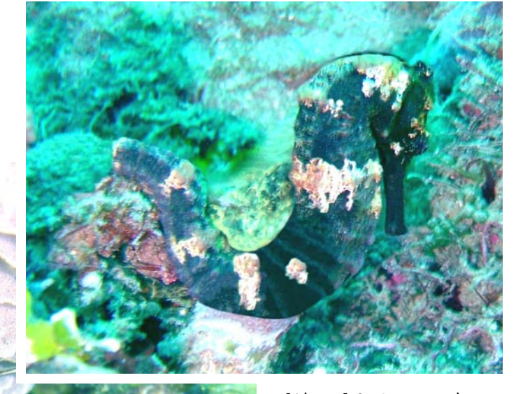
[Above] St. Lucia seahorse, sighted near the base of the Pitons.