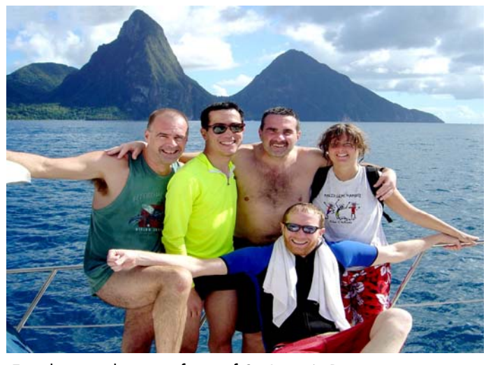
Five happy divers in front of St. Lucia's Pitons.

Dive trip synopsis There were a few things about the diving that really stood out for me on this trip. First were the swarms of huge schools of small fish. Second was the absence of large fish. This is the first week of diving where I've not seen even one shark, ray, or even a mildly big fish. Third were the private inshore traps that the DM warned us not to touch no matter what. And finally was the overabundance of small critters crawling the reefs in open daylight. Never have I seen a