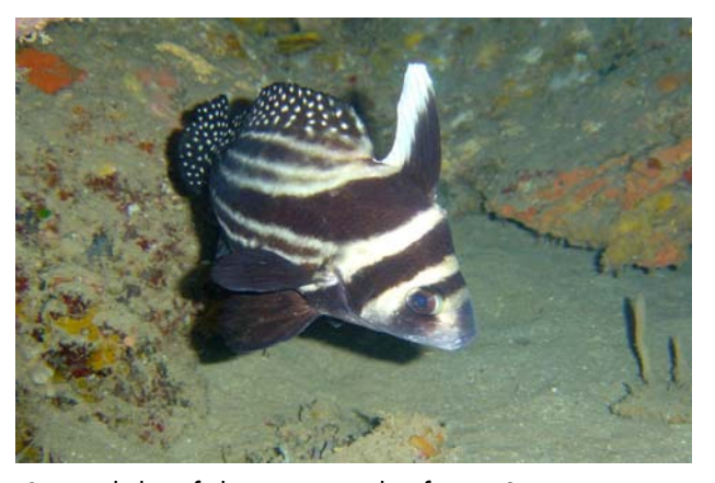
Spotted drumfish practicing his figure-8s