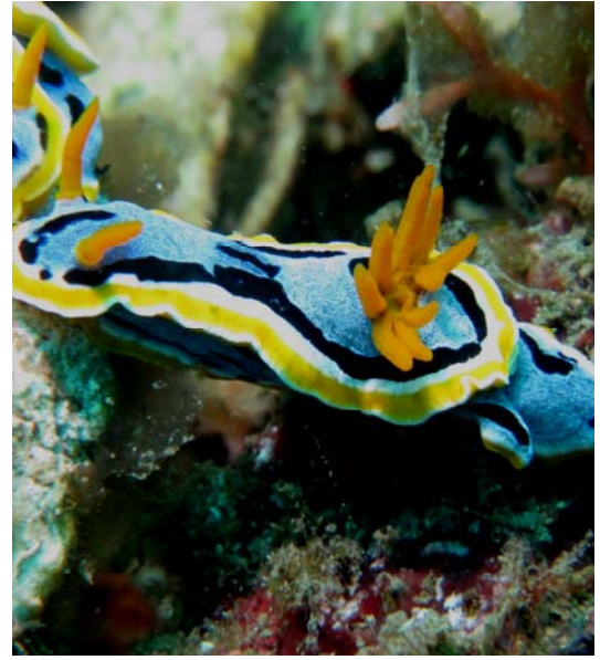
Colorful Nudibranchs, Raja Ampat