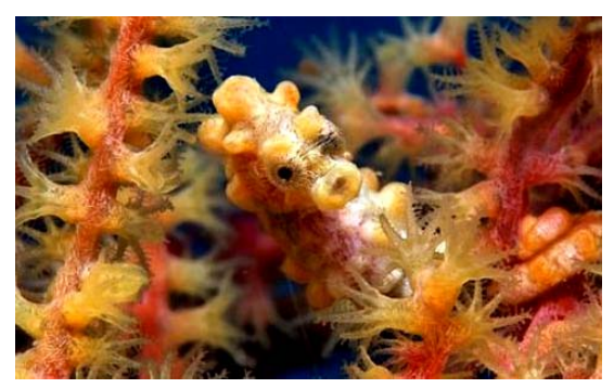
Bargibanti pygmy seahorse, Komodo