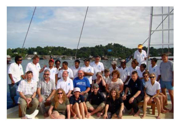
Raja Ampat divers