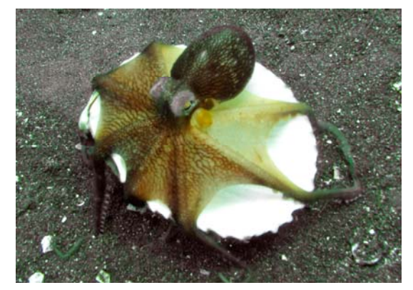
Coconut Octopus, Lembeh Strait